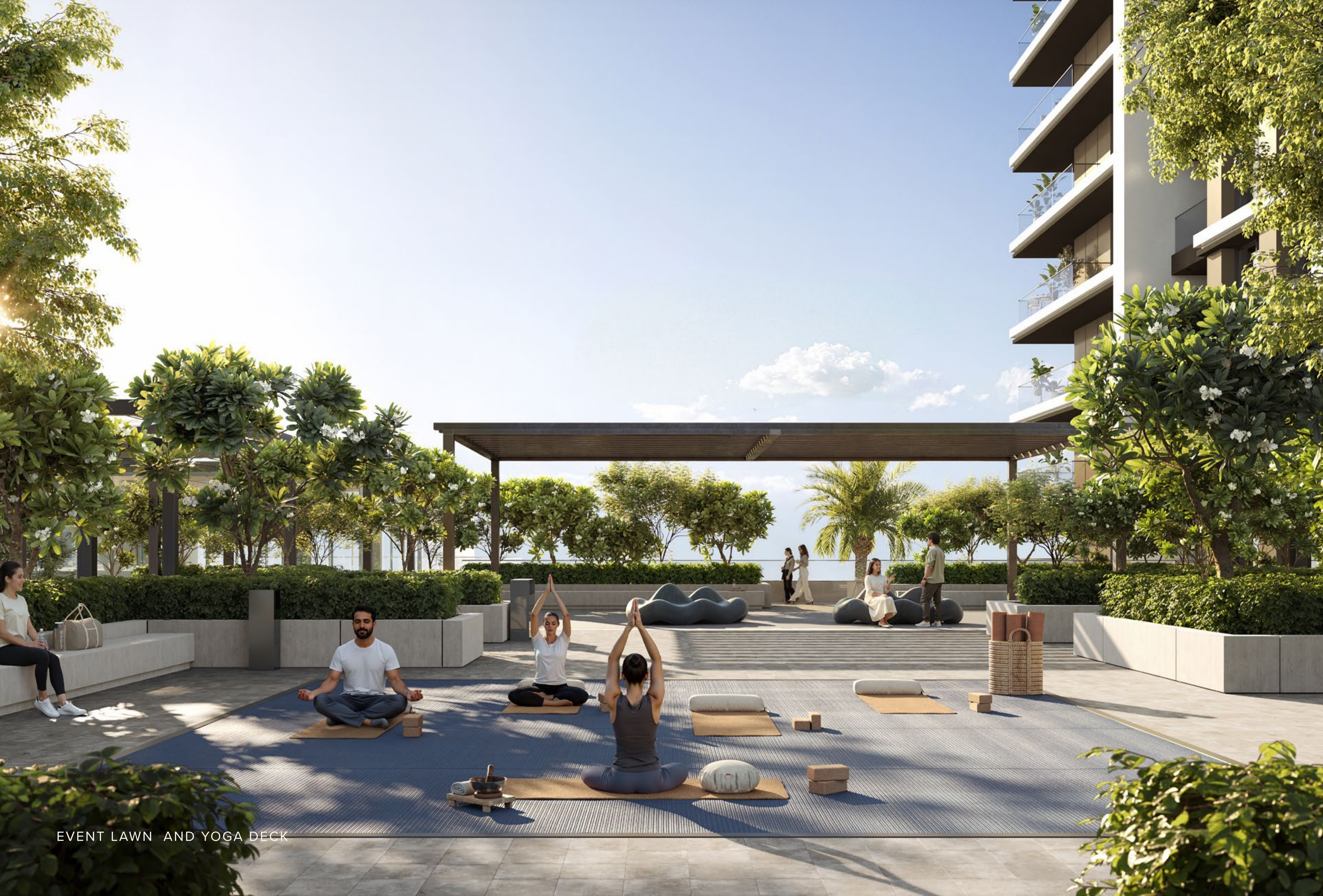
EVENT LAWN AND YOGA DECK