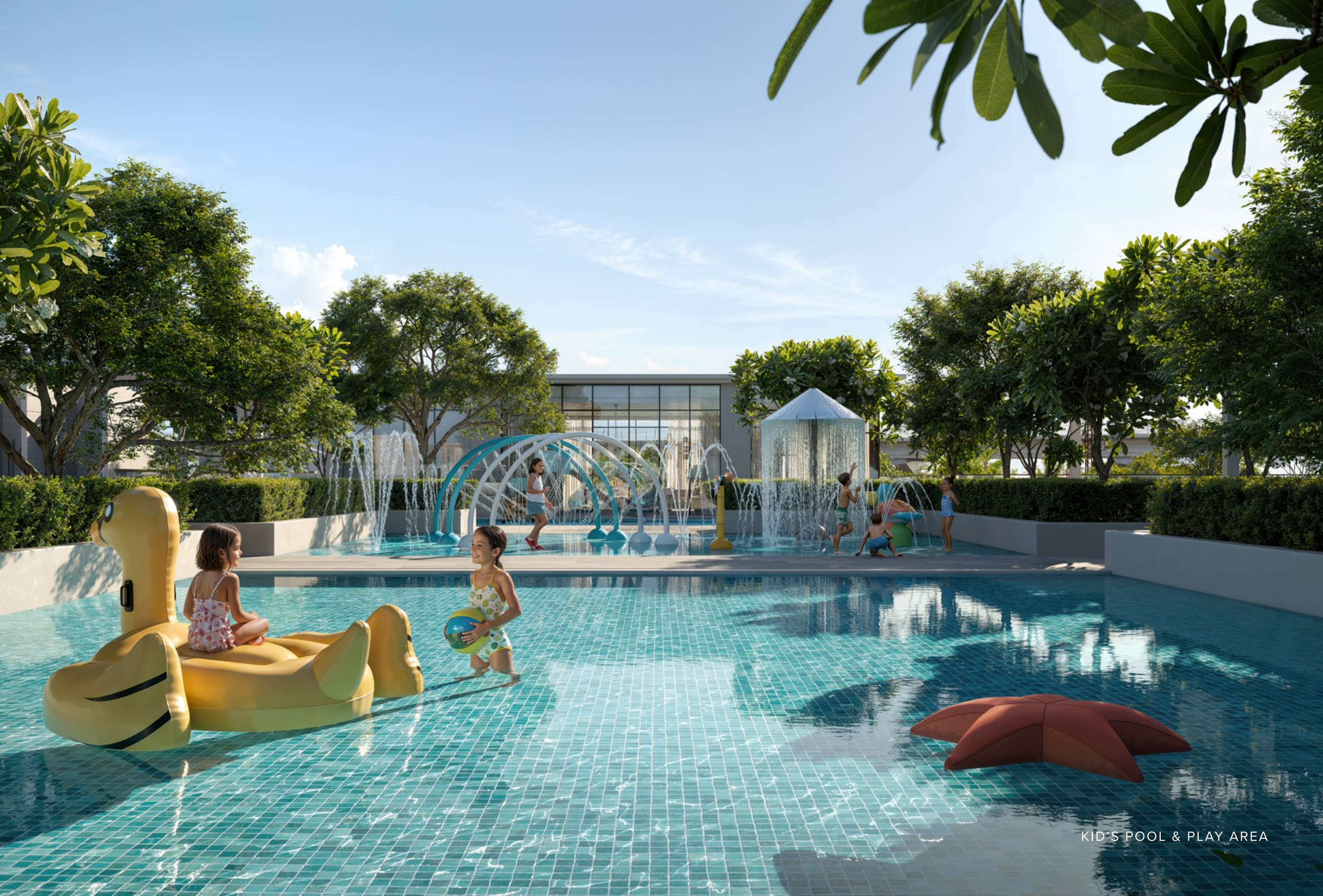
KID'S POOL & PLAY AREA